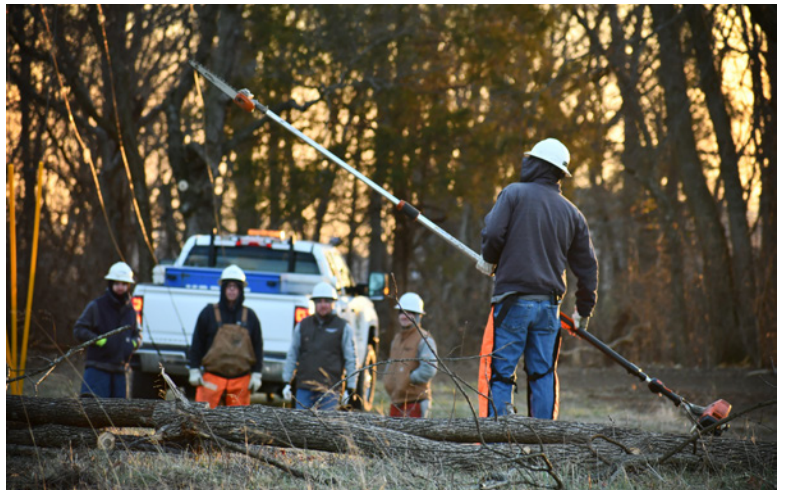
Above, Owen Electric crews participate in a chainsaw operation and line clearing workshop. Linework takes a variety of specialized skills, including the safe removal of trees and limbs from energized lines.