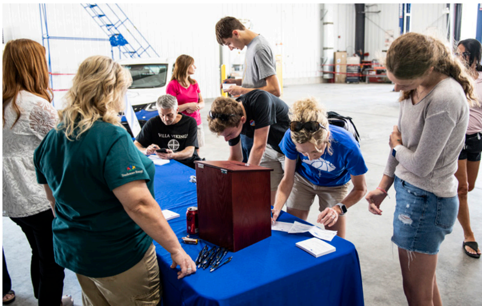
The annual meeting scholarship booth stayed busy in 2023 with students entering to win the special $2,000 scholarship that is awarded annually.

that the grand prizes and a special $2,000 scholarship will be drawn following the business meeting portion of the annual meeting. Recipients must be present at the drawing at Arthur Service Center Friday evening to register and win. All remaining prize winners and the annual scholarship recipients will be drawn for the following week; members need not be present to register and win.