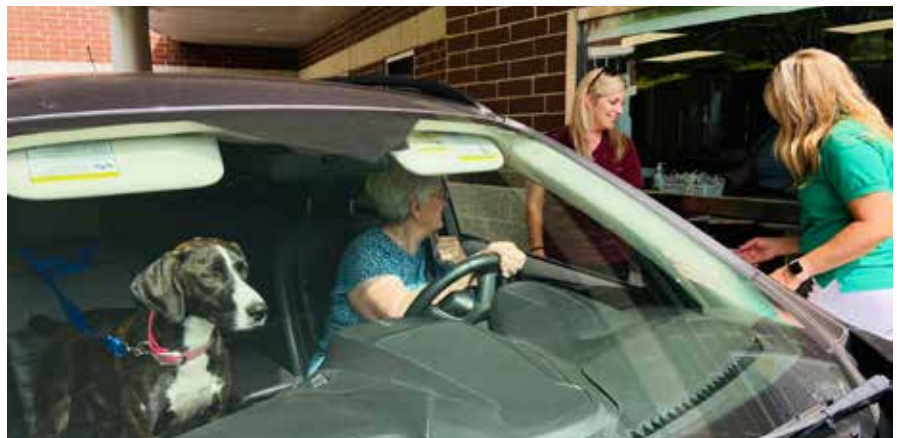
A member and her best friend drive through to pick up her bucket, bulbs and appreciation gift during the 2022 Annual Member Appreciation Days event.

This year, we're excited to announce that the grand prize and a special $2,000