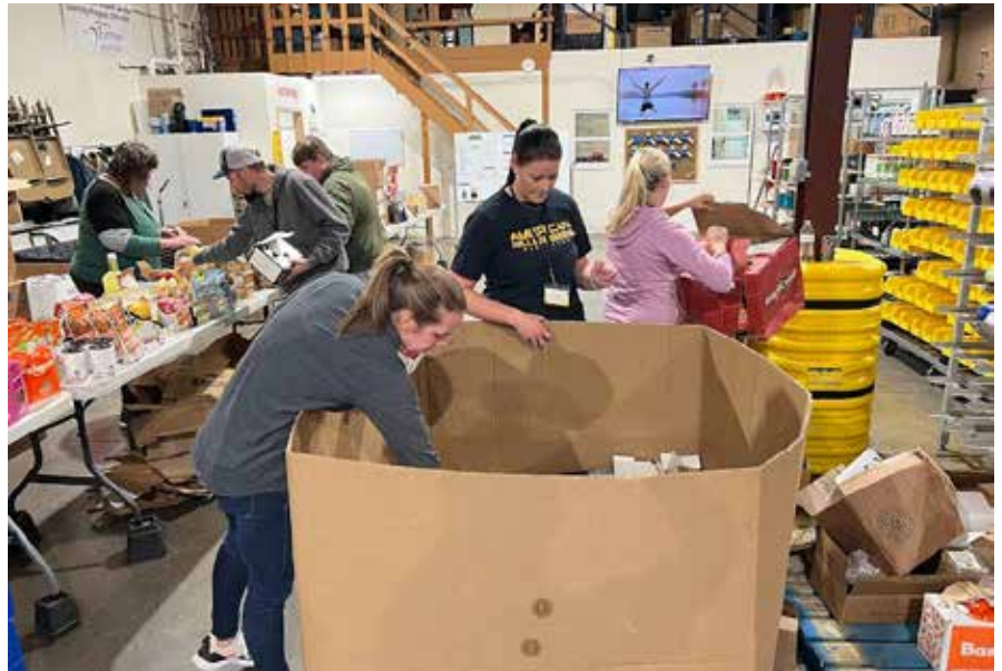
Owen Electric employees volunteer at Master Provisions, a distribution center that partners with local organizations to provide food, clothing and other necessities to the community.

In times of crisis and need, our crews have helped more than 50 utilities restore power in more than a dozen